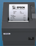
Thermal Receipt Printers