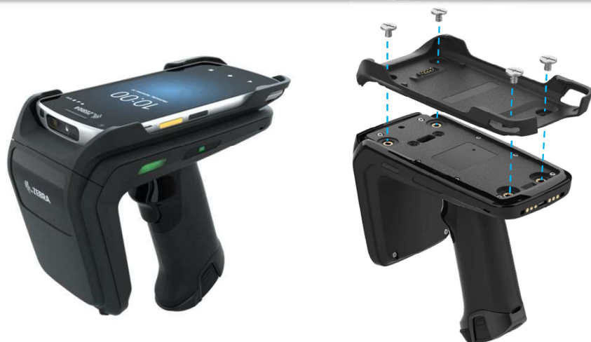
RFD40 RFID Sled See table for part numbers