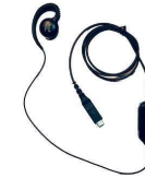
NEW: Wired USB-C headset For PTT and VOIP