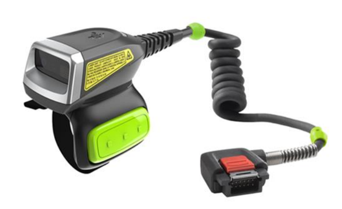
RS5000x Standard Trigger Version