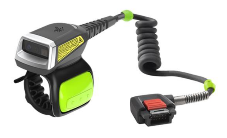
RS5000x with Larger Trigger for use with Freezer Gloves