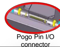
Pogo Pin I/O connector