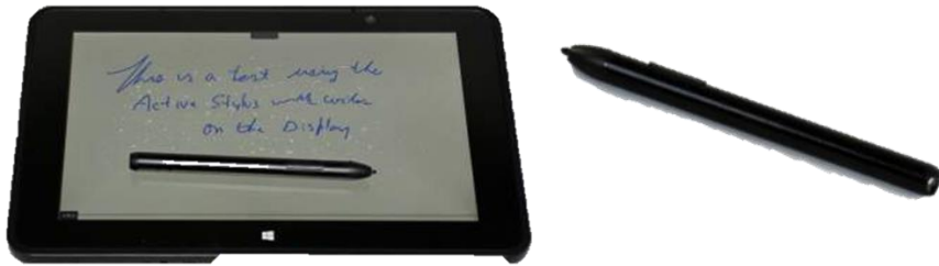
KT-ET5X-ASTY1-01 (WIN, 10" only) KT-ET5X-ASTY2-01 (ANDR)