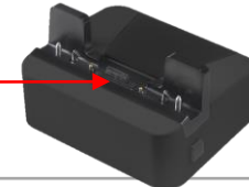
Sealed I/O Connector comes with rugged frame