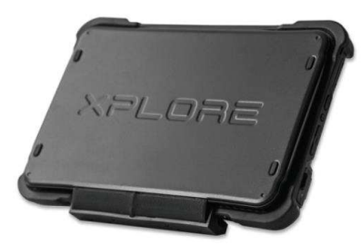
Keyboard in closed position via magnets, protecting display glass