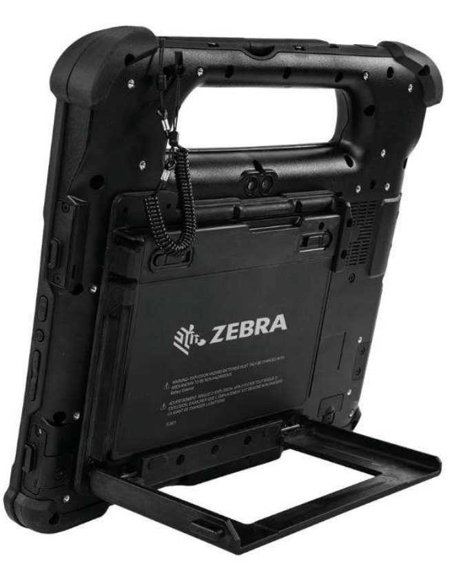
Part Numbers: 410056 (L10 Kickstand Extended Battery Bracket kit)

The kickstand conveniently holds your Zebra L10 rugged tablet upright for easy reading and touch while in the field and when using the Companion Keyboard . When you are ready to start walking, the kickstand folds away. An integrated battery bracket holds the extended battery for when you need up to 27 hours of battery life. The kickstand/bracket does not need to be removed when docking in the Vehicle, Office, or Industrial docks. It can also be used in combination with the optional Soft Handle and Stylus pen accessory set.