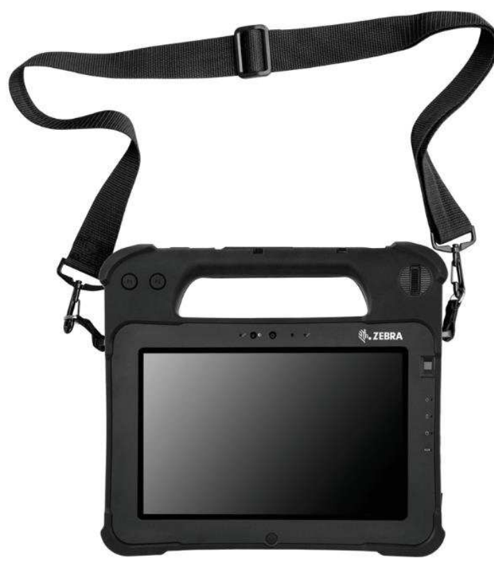
Part Numbers: 410057 (L10 Shoulder Strap)

The shoulder strap attaches to the optional top handle accessories offered with Zebra L10 tablets. It is ideal for handsfree, long-distance carrying, and it is adjustable for height. The wide strap enhances comfort and can be easily attached and detached via clips.