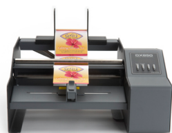
DX850 LABEL DISPENSER

are the perfect semi-automatic labeling solution for cylindrical containers as well as many tapered containers including bottles, cans, jars and tubes.