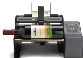
AP362 LABEL APPLICATOR